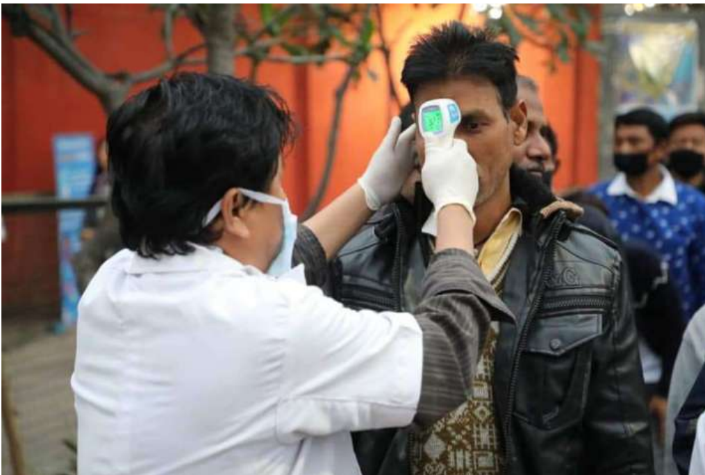
A health worker conducts temperature checks at the India-Bhutan border.

The Bhutanese has reported that following advice from the health authorities in Bhutan, there has been a significant increase in the number of people coming forward to be tested for COVID-19 after traveling outside of the country or experiencing common flu symptoms.