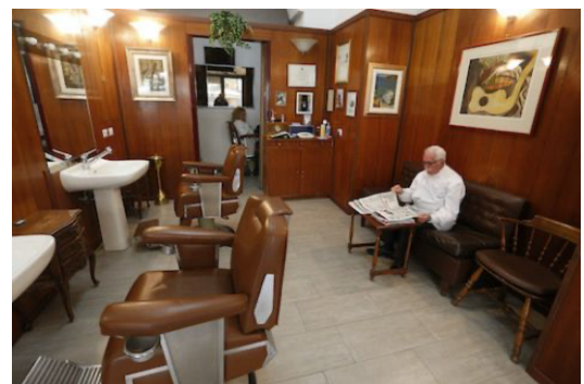
A barber reads a newspaper in his empty shop in Rome March 10.

But I have to confess: I hope that once this emergency passes, the broadcast of the daily celebration of the Mass by Francis will not continue, or that it will become superfluous. In a synodal church that tries to become more missionary by being all-ministerial, the identification of the pope as "celebrant-in-chief" could have long-term side effects contrary to Francis' vision for the future of the church.