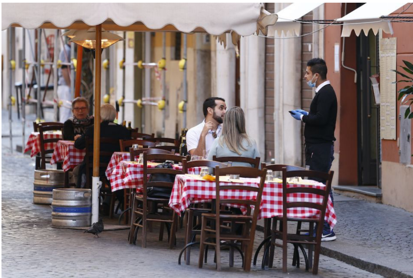
A waiter wearing a mask for protection from the coronavirus serves a table at a restaurant near the Vatican in Rome March 11.

know that can put science in charge of giving advice to politicians.