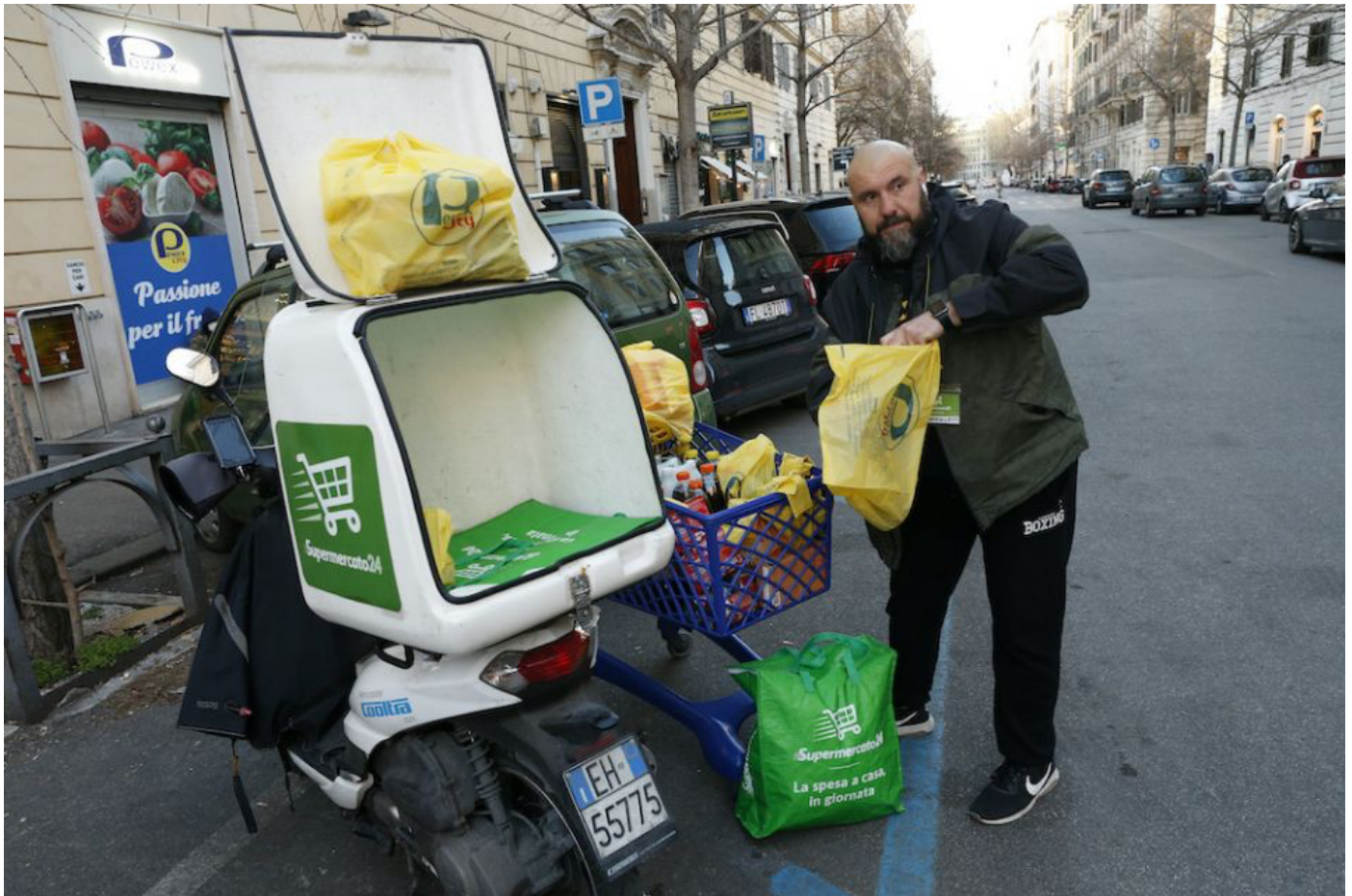
A delivery driver transfers groceries from a shopping cart to a motorbike outside a supermarket in Rome March 11.

It remains to be seen how this reversal will affect the Italian bishops' conference's recommendation that individual bishops order the closure of all churches in Italy until at least March 25. (Some regional bishops' conferences, like Lombardy, had not accepted that recommendation.)